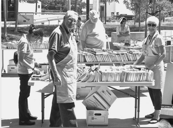
BookStore and BookSales bring us necessary funds